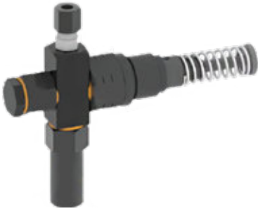
(SA 226) 0.2 cc / stroke

Mounting thread : M22 x 1.5p Outlet thread : 1/4" BSP Optional O/P thread : M10 x 1P