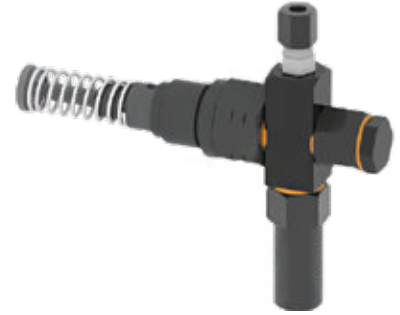
(SA 069) 0.35 cc / stroke

Mounting thread : M22 x 1.5p Outlet thread : 1/4" BSP Optional O/P thread : M10 x 1P